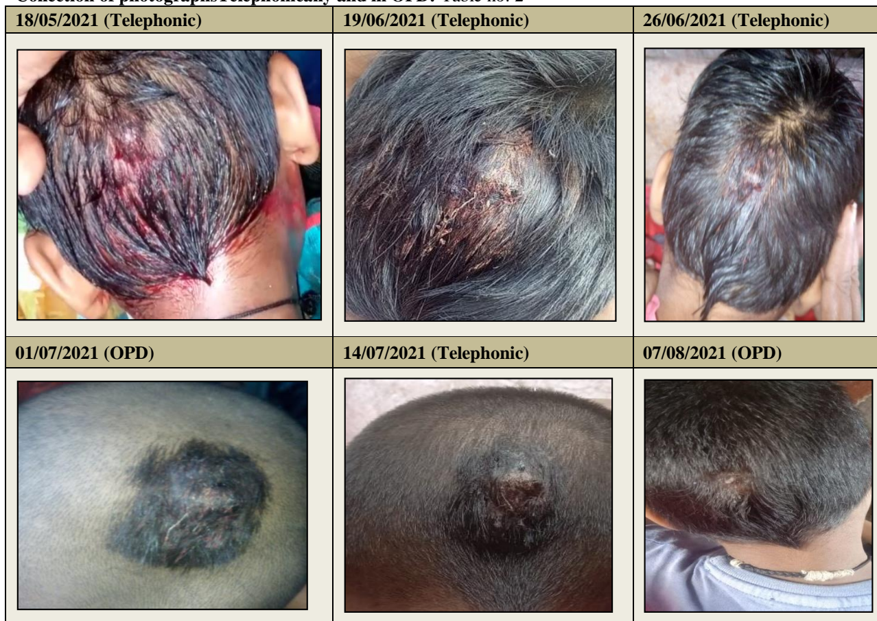
Collection of photographs Telephonically and in OPD: Table no. 2