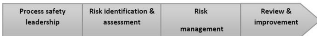
Figure.1. components of the PSM framework

Regular review and audit of compliance with the PSM framework is vital to ensure that HS&E and process safety performance continue to meet the defined targets.