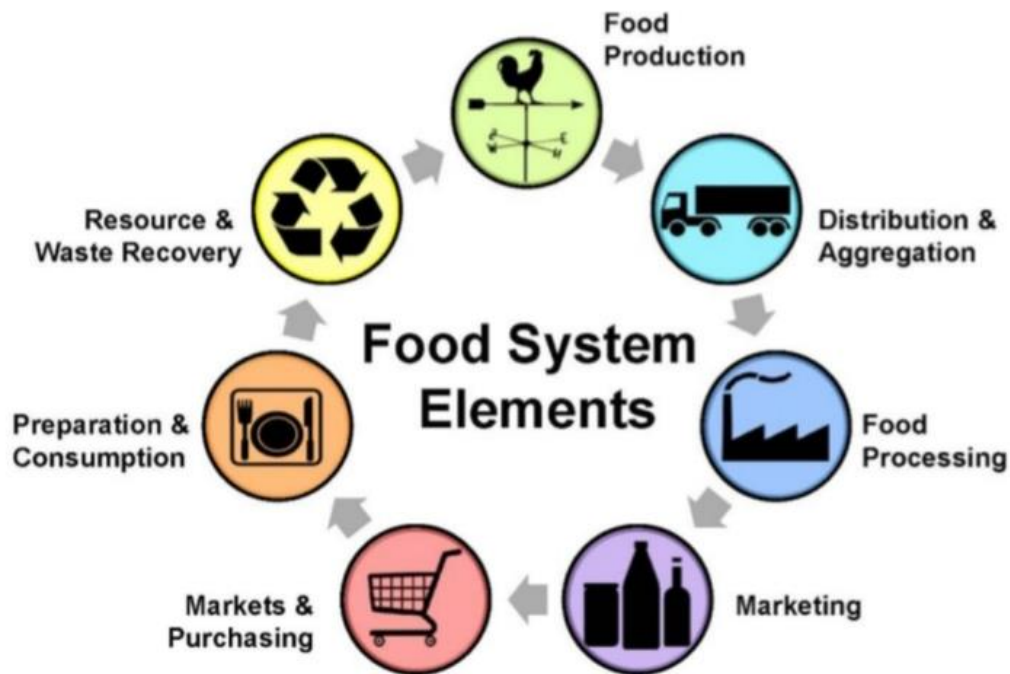
Fig 1. Blockchain can be exploited in many key stages in the food logistics

Blockchain empowers food suppliers at all supply chain stages to obtain data from consumers. That's the thing consumers can really benefit from more information about their purchased food.