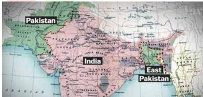
India-Pakistan border, 1947

Whereas the walls of the Ghetto Nuovo are a means to provide a safe, segregated place amidst a prevailing culture of visibility, the Great Wall of China functions as an agent of establishing and maintaining the dominant ideology. Referring to Borges’s interpretation of the Great Wall, the infinite Strip of Exodus, likewise, serves as strategic device, both to eliminate the insignificant past and to create an ideal unity during the building process. In addition, its confinement and self-restriction provide a social sieve against the “impure” territory outside the walled area. By delimiting the environment and excluding the chaotic “bad half of the city,” Exodus affirms its identity and meaning within the “good half of the city.” presents the important, valuable part, whereas the zone outside the Strip is an underdeveloped and futile area of urban chaos.