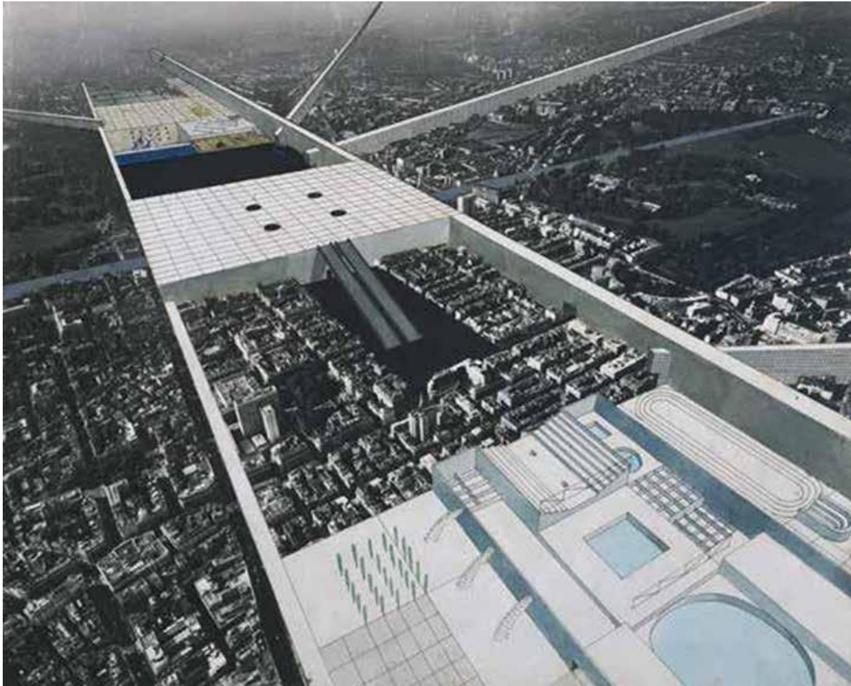
The Strip, 1972

The tip of the Strip continuously expands into the existing urban fabric of London, even though a few of the old buildings are preserved and incorporated into the new territory. Most of the structures from the past will be destroyed and replaced by the constantly modified models of public monuments and symbols. Thus, the scheme for the monumental linear form of the Strip creates the maximum possible contrast between the new area within the Walls and the context of the city. The violation of the urban fabric through architecture produces the effect of a cynical and blunted rendition of power so that the city of London is treated as an insignificant series of private spheres, whereas the new world is projected as a meaningful environment of public spaces. The Walls of Exodus divide the city into a good half and a bad half, into the disparate spaces inside and outside the enclosure. Inside the Wall, the territory of the strip.