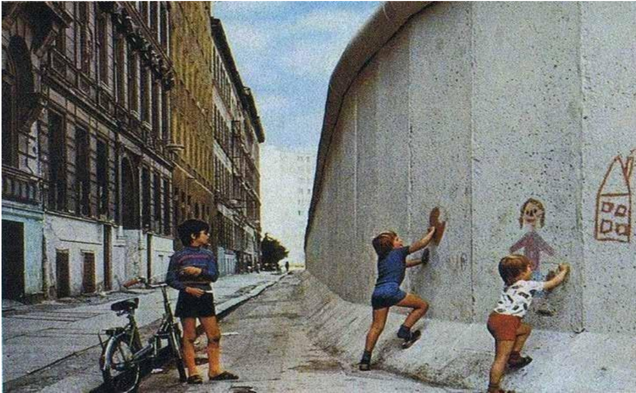
The Berlin Wall as architecture (Source: Koolhaas and Mau, S, M, L, XL)

to meaning [...] ... I would never again believe in form as the primary vessel of meaning.” [5] “As an object the wall was unimpressive, evolving toward a near dematerialization; but that left its power undiminished. The wall was not an object but an erasure. ...It was a warning that – in architecture – absence would always win in a contest with presence.” At this point, Koolhaas acknowledges, “it was as if I had come eye to eye with architecture’s true nature.” [6] Though its physical presence is marginal, “in its ‘primitive’ stage the wall is decision , applied with absolute architectural minimalism.” [7]