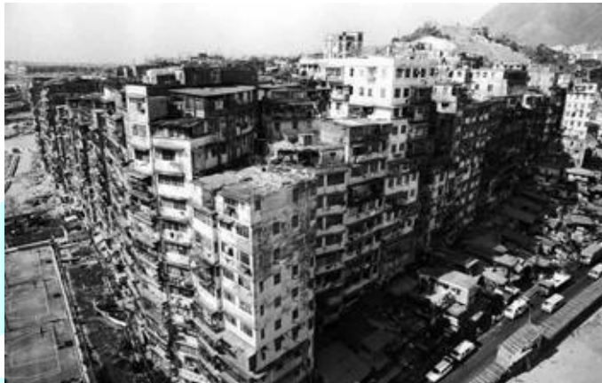
Kowloon Walled City, Hong Kong, 1980

Its constant dampness came from overhead pipes carrying water, which, along with artificial lightening also contributed to its greenish atmosphere. As there were no automobiles in Kowloon, the only circulation space was a warren of passages that one could traverse without once setting foot on the ground. The roofs cape was the only escape from the density below. Without legal regulations regarding property rights, labour, or the environment, the Walled City quickly became a hotbed of untaxed and unrestricted economic activities of any kind. Many illegal businesses flourished under conditions of exploitation so that Kowloon became synonymous with all that was dark and threatening in society. Of course, the illegal activities could flourish inside the Walled City only because of the demand from outside. Eventually, after its final demolition in 1993, the site became a public park and the former residents were moved to public housing areas. Yet, behind the negative image of decay and social marginalization, Kowloon was closest to an autonomous, self-organizing city. Despite its chaotic structure, it also provided utopian conditions for its inmates.