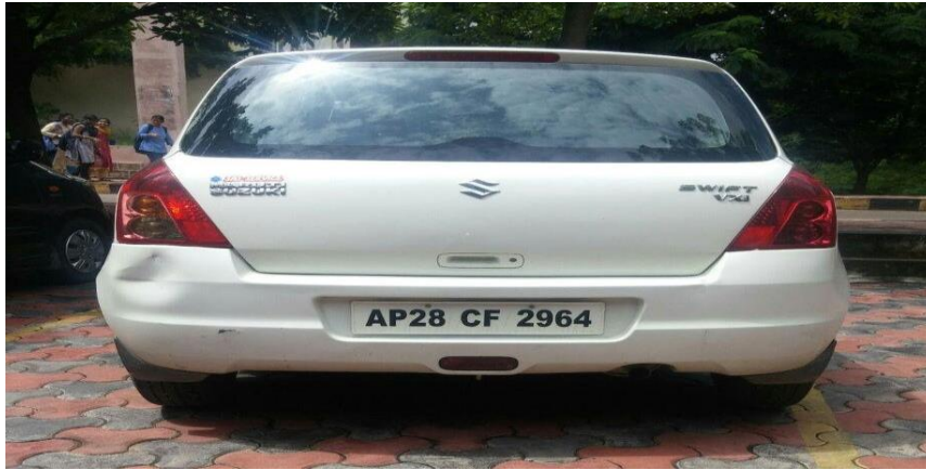
Figure 1 Input Image

Before a computer vision method can be applied to image data in order to extract some specific piece of information, it is usually necessary to process the data in order to assure that it satisfies certain assumptions implied by the following methods,