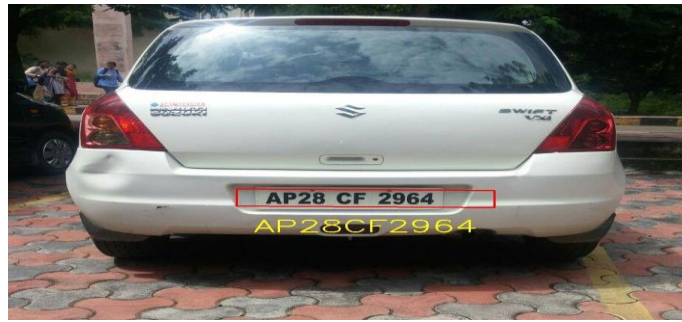
Figure 3 Output Image

At some point in the processing a decision is made about which image points or regions of the image are relevant for further processing. For example