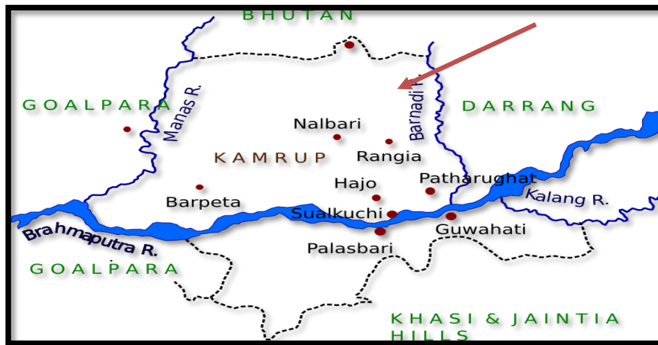
Fig.1: Locational map of study area.

different castes, communities, creed and cultural traits with a total population of 3,03,229 persons scattered over 290 villages consisting of 66,731 households (2011 census).