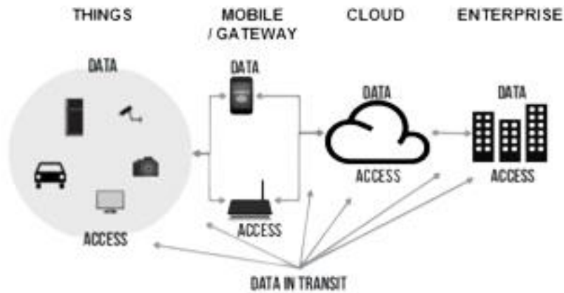
Figure 1. Security & Privacy in IOT

iv. Access control: Only authenticated and authorized person can access the control. The general user can access the system by providing user name and password & their access rights, which will be controlled by the system administrator [4]. Different user can access the specific portion of the database or programs to smoothen running the system.