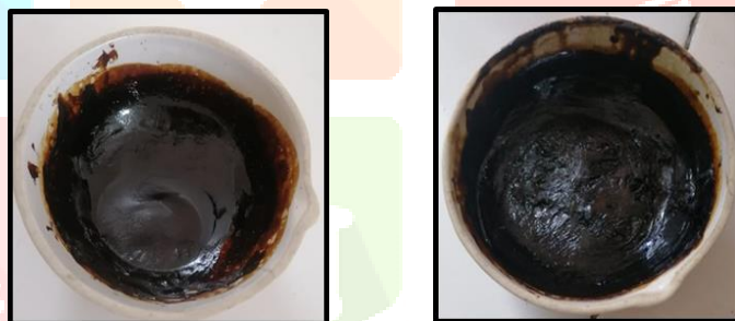
leaves and flower extracts of Couroupita guianensis [(CgL),(CgF)]

According to our analysis, we found Hydroalcoholic solvent is the most suitable solvent for extraction. About 350g of powdered leaf and 100g of powdered flower were macerated separately with 70% methanol and 30% water in a container. The container is then closed and kept for about three days. The content is stirred periodically. After three days filtration is done and the micelle is separated from the marc, the micelle is then separated from the menstrum by evaporation in an hot air oven. Both the extract leaf extract (CgL) and flower extract (CgF) of Couroupita guianensis were stored separately.