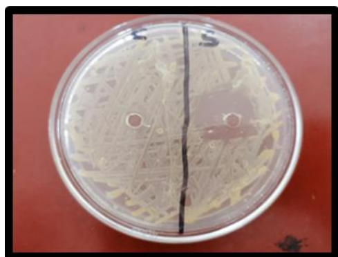
Zone of inhibition of standard and control

The methanolic extract of CgL and CgF extract were screened against standard antibiotic ciprofloxacin to check the antibacterial activity by well diffusion method which showed valuable zone of inhibition.