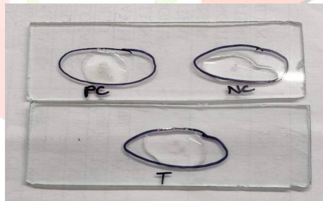
Figure 3: Negative catalase test