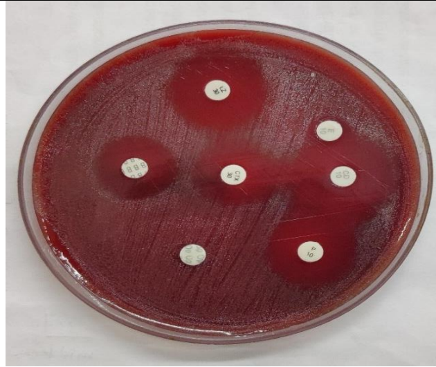
Figure 4: Antimicrobial susceptibility testing showing that the isolate was resistant to optochin.