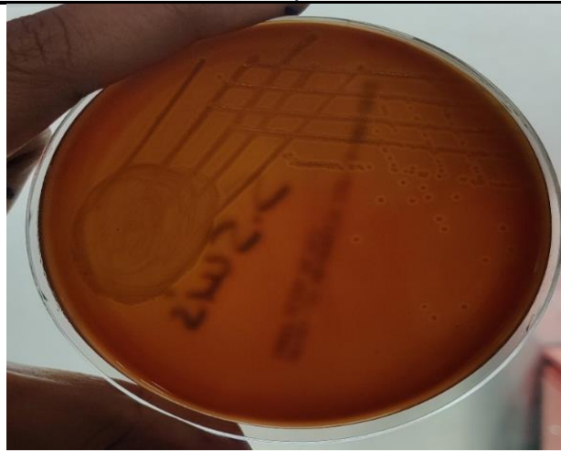
Figure 1: Colonies of S. suis on 5% sheep blood agar showing \alpha - hemolytic colonies