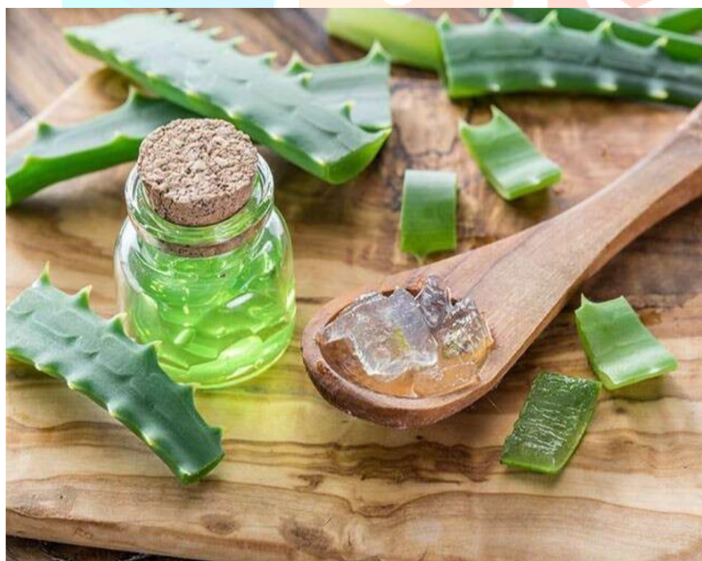
Dig. no.1: Aloe vera.