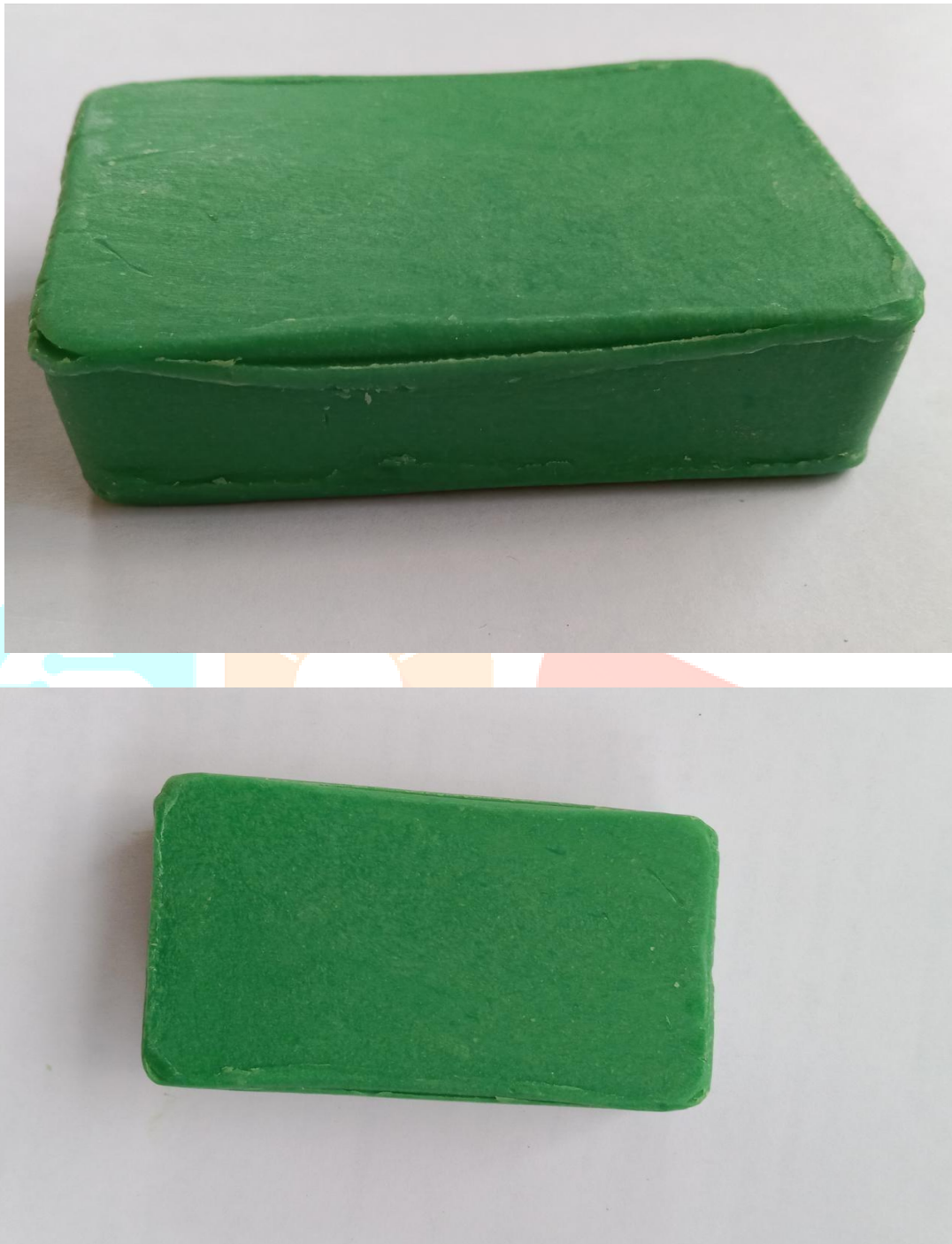
IMG .1. FINAL FORMULATION OF HEARBAL SOAP.