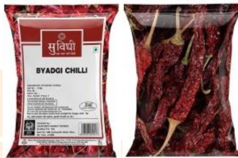
Fig. 7 Consumer pack of Byadgi chillies with stem

At the producers' level, Byadgi chillies are packed in jute gunny bags (Fig. 1.9). The capacity of gunny bags is generally 20-100 kg. Farmers use old gunny bags to pack chillies before selling. Only the exporters repack them in good new gunny bags and sometime in the gunny bags with polythene liner inside. Byadgi chillies are also packed in polythene bags and cartoons. Fig. 3.9. Packaging chillies in gunny bags at producers' level and wholesaler packing in 3000 gauge low density polyethylene film pouches are done for 100 g consumer unit packs to give a shelf life of 3 to 6 months (Fig. 1.10). Under tropical conditions, 200 gauge low and high density polyethylene films are suitable for packing of whole chilly in units of 250 g. each. Such packs can be stored at a cool, dark, dry place for about a year. Dried Byadgi chili is available in market in the packs of 5, 10, 15, 20, 25 and 40kg.