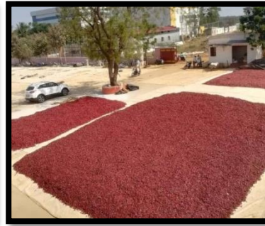
Fig. 6. Solar drying

Fresh produce dried on open spaces like roadsides remain exposed to weather for the entire drying period (5-15 days), and may cause contamination with dust and dirt, damaged by rainfall, animals, birds and insects. The losses may range from 70 to 80% of total quantity. Poor handling of fruits results in bruising and splitting. Bruising causes discolored spots on pods, splitting leads to an excessive amount of loose seeds in a consignment. Improved drying system could be used to ensure cleanliness and uniform colour of the product.