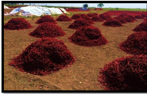
Fig. 5. Byadgi chilies after harvest at the farm