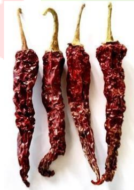
Fig. 3 Byadgi Kaddi