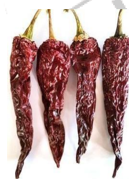
Fig.4. Byadgi Dabbi