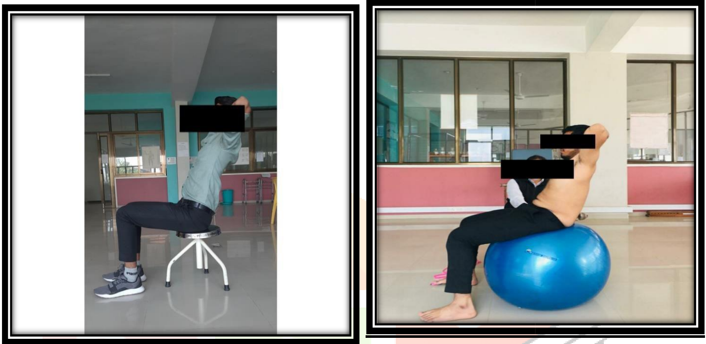
Figure 1 & 2 Illustrate conventional abdominal stabilization exercise & swiss ball abdominal stabilization exercise

This study was a Comparative study. Sample Size was calculated using G Power. Total 50 participants were enrolled from the Uka Tarsadia University Campus. The inclusion criteria were all willing Male and Female participants of 18-25 years age group and with normal body mass index of 18.5-24.9 kg/m 2 . Participants were excluded if they had a history of heart and respiratory diseases, musculoskeletal disorder, overweighted and underweighted individuals, participants who had undergone abdominal or thoracic surgery within the past 6 months. The study protocol was approved by Institutional Review Board. All procedures performed were in accordance with the ethical standards of the institutional research committee. All participants gave their signed informed consent before enrolling the study. Introduction about the study was given to all participants. The outcome measures selected in this study were Systolic Pressure, Diastolic Pressure, SpO 2 , Heart Rate, Cardiac Output Estimate (14) .