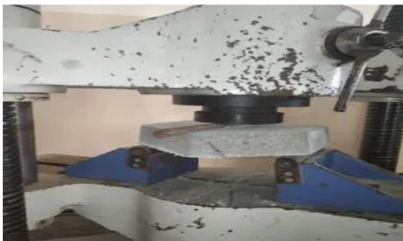
Figure 3: Flexural strength test setup

The paver blocks manufactured will be used for road surfacing. The flexural property of the paver block is very important to be observed when used on roads where traffic is running. The test specimen shall be checked for length, width, thickness and aspect ratio. The apparatus used for the test shall be same as per IS: 15658 and IS: 516. The supporting rollers of the machine should have diameter in the range of 25mm to 40mm. The distance from centre to centre of rollers shall be adjusted to fix the specimen -50mm. Four paver block randomly selected for the test and kept with capping material as per IS: 15658. The load shall be applied without any shock and increased continually @ 6kN/minute and shall be increased until failure of the specimen.