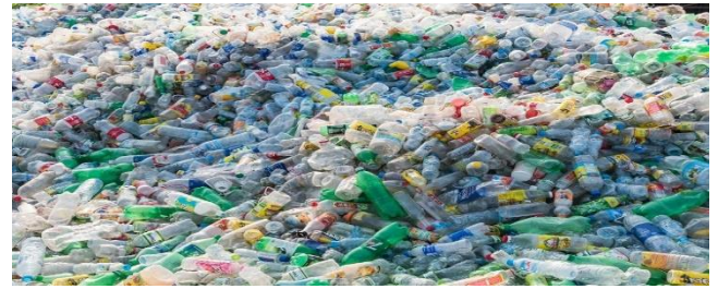
Figure 1: Waste Plastic

into uniform granules with the inherent reinforcing materials such as steel and fiber removed along with any other type of inert contaminants such as dust, glass, or rock. This is the physical compositions of the crumb rubber has been procured From Mandideep Bhopal, M.P