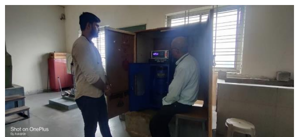
Figure 2: Compressive strength test setup

The paver block specimens 4 in number shall be selected randomly and physically checked for observation of dimensions, aspect ratio and plan area before testing as per code. The compressive testing machine of capacity 200 tons used for test. The specimen shall be capped with 4mm thick plywood sheets of size larger than the specimen and placed between the bearing plates of the CTM and tightened by hand. The load shall be applied without any jerk and increase continuously @15±3 N/mm 2 per minute until the specimen fails. The failure load is recorded in N. The apparent compressive strength of the paver block is calculated by using formula, compressive