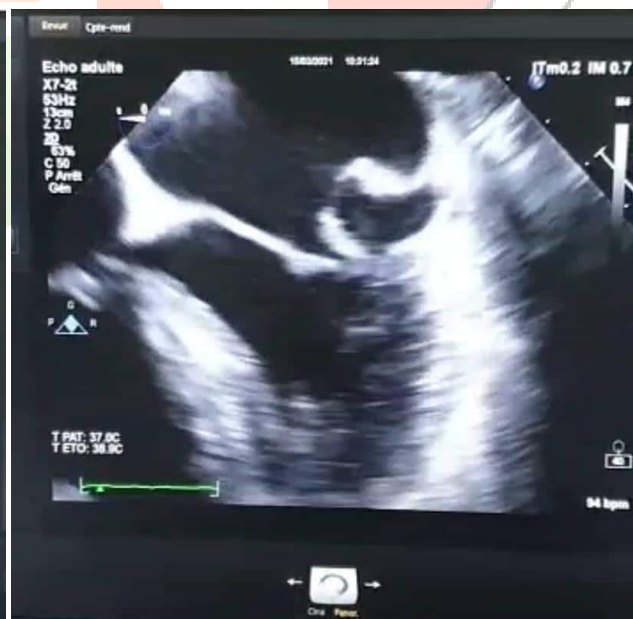
Figure 1B: Transesophageal echocardiography image showing the P2 prolapse of the mitral valve