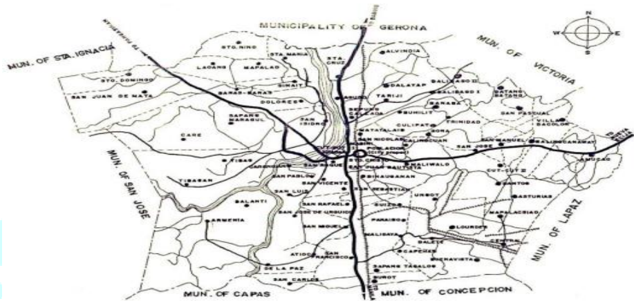
Figure 2. Map of Tarlac City

The City of Tarlac is situated at the center of Tarlac province. It serves as the capital of the province. To its north is Gerona and Santa Ignacia, west is San Jose, south is Capas and Concepcion, and its eastern boundaries are Victoria and Lapaz. It consists of seventy-six (76) barangays namely Aguso, Alvindia, Amucao, Armenia, Asturias, Atioc, Balanti, Balete, Balibago I, Balibago II, Balingcanaway, Banaba, Bantog, Baras-baras, Batang-batang, Binauganan, Bora, Buenavista, Buhilit, Burot, Calingcuan, Capehan, Carangian, Care, Central, Culipat, Cut-cut I, Cut-cut II, Dalayap, Dela Paz, Dolores, Laoang, Ligtasan, Lourdes, Mabini, Maligaya, Maliwalo, Mapalacsiao, Mapalad, Matatalaib, Paraiso, Poblacion, Salapungan, San Carlos, San Francisco, San Isidro, San Jose, San Jose de Urquico, San Juan Bautista (Matadero), San Juan de Mata, San Luis, San Manuel, San Miguel, San Nicolas, San Pablo, San Pascual, San Rafael, San Roque, San Sebastian, San Vicente, Santa Cruz, Santa Maria, Santo Cristo, Santo Domingo, Santo Niño, Sapang Maragul, Sapang Tagalog, Sepung Calzada, Sinit, Suizo, Tariji, Tibag, Tibagan, Trinidad, Ungot, and Villa Bacolor.