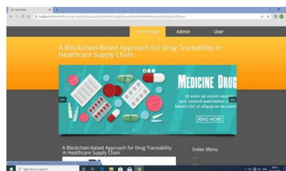
Fig Homepage: our project has been start its operations in the home page