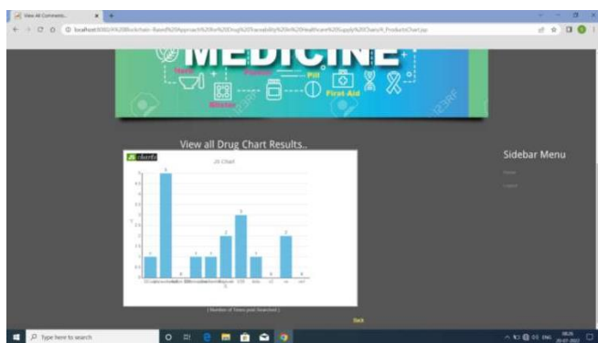
Fig: view all drug chart results: In this page we have to view drug chart