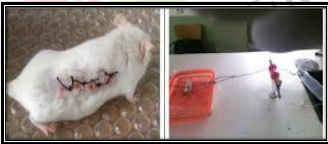
Figure 3 : Photograph of incision wound on day 0 and measurement of tensile strength on 10 th day using water flow technique [24].