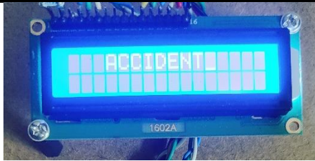
Fig 3: Accident displayed in LCD

ACCIDENT LOCATION: http://www.google.com/maps/?q=12.909314780223378,77.56666506506677