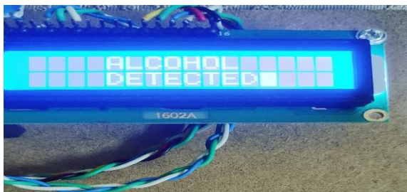
Fig 1: Alcohol detection in the system