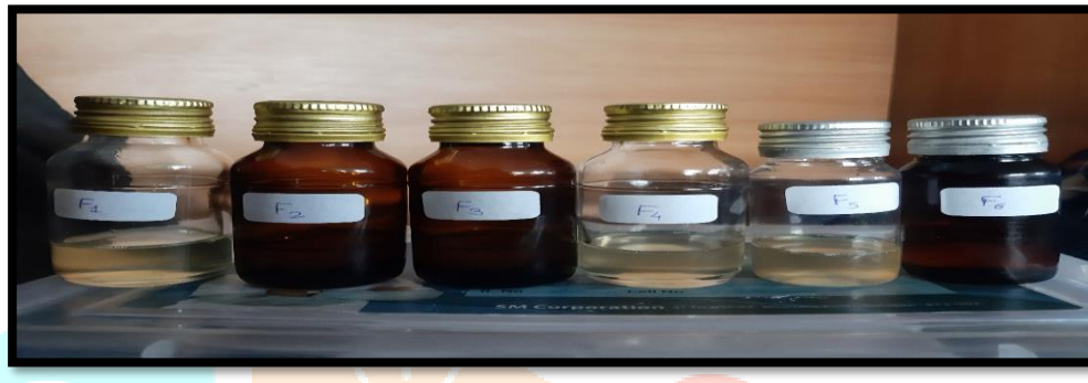
Figure No.1: Formulations of all herbal tonics

Formulations of all herbal tonic were shown in figure no.1: