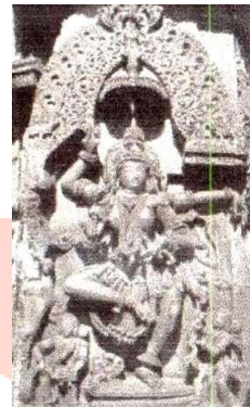
Fig – 4. Dancing Saraswati, Hoysaleswara Temple,

An unusual icon is the Dancing Saraswati image from the Hoysaleswara Temple, Halebidu (fig – 4). She is seen in the aindra sthana (AD, sh. 278). She has four hands. One of the right hands appears to be in musti (AD, sh. 116-111), and the other is in Abhaya mudra . One of the left hands is in Ardha Candra (AD, sh.111). She is wearing numerous ornaments and very elaborate headgear. All the Swarupas of the Hindu gods and goddesses are also depicted, carved on the temple walls. The Indian classical dancer often shows these forms through stories in dance, such as the Dashavatara of Vishnu, Shiva in his various Tandavas , and so on. In the Natyashastra , the sculptors have also used similar techniques to depict multiple movements. For example, the Vrscika Karana (shloka 107, Karana 47) describes how in this Karana, the hands are bent toward the elevations of the shoulders and the right leg is bent towards the back and kept at some distance from it. The Mayura Lalita Karana (shloka 104, Karana 80) guides the dancer to make a vriscika of the leg, keep the hands in recital and turn the trika round and round.