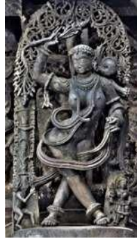
Fig – 2. dance postures - ChennaKesava Temple, Belur

at the knee and the other leg and knee raised. The right hand is in Abhaya-mudra , and the left-hand holds the tail of the Naga. Two small figures flank him, each holding yak-tail fans, while the two more prominent figures are in garuda sthana (AD, sh. 280) with their hands folded in Anjali-hasta (AD, sh. 276).