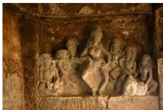
Fig – 1. Dance panels, Ellora cave 7

There are sculptural panels showing dancers in performances found in several temples. The sculpture in Khajuraho – shows one or two dancers accompanied by a group of musicians and can be identified through costume, jewellery, and hairstyles. The musicians hold musical instruments such as mridangam, veena, cymbals, flute, etc. The dance panels at Ellora cave 7 (Fig – 1) are focused on the dancing girl in the centre where the dancer in the " dvibhanga " poses in " aramandi ". Both her hands are in Kataka mukha hasta. She is flanked on both sides by seated female musician figures. While one plays the flute and the other plays the drums, and the rest are given "Tala."