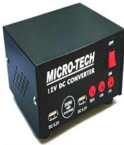
Figure 4: 12v DC to 220v AC converter