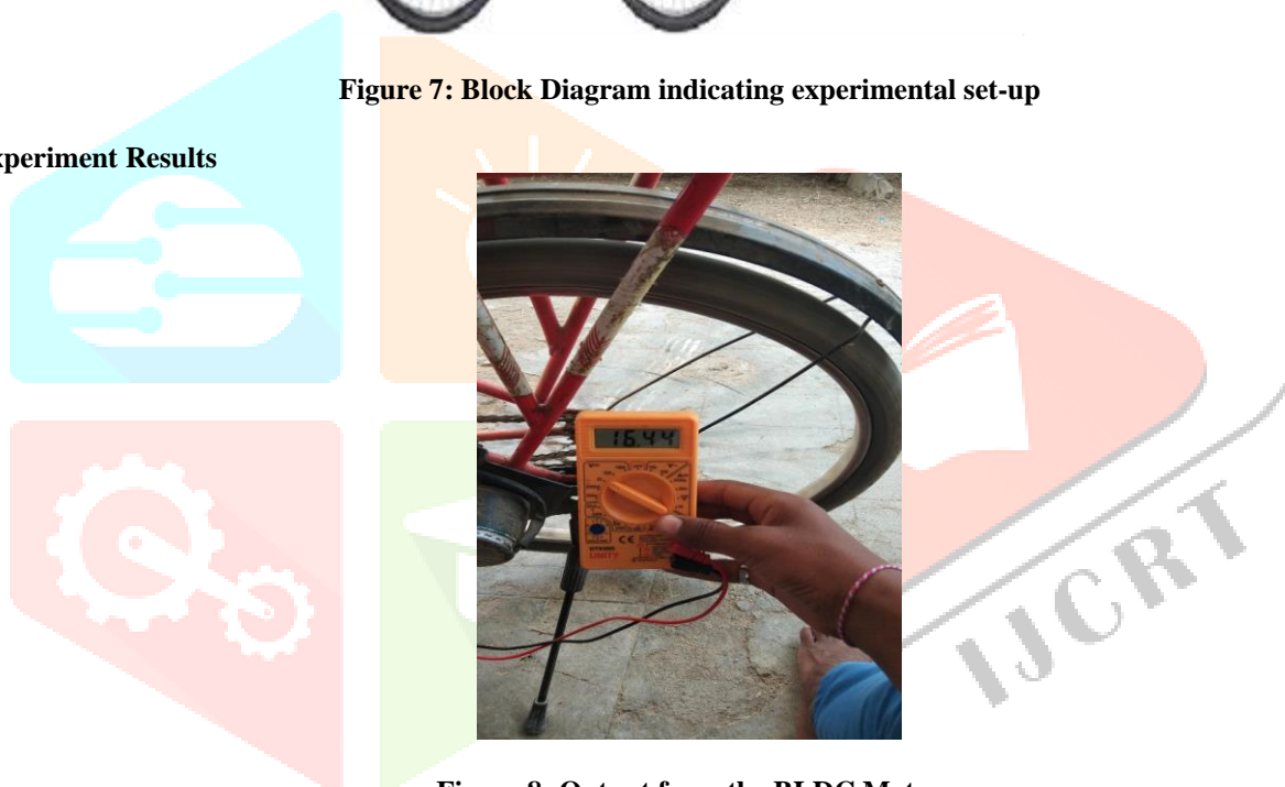
Figure 8: Output from the BLDC Motor

In this system when the charge of the battery is completely got discharged just, we need to plug out the bldc motor wire from the controller and we need to connect the output of the bldc motor wires to the converter. The minimum power needed for the converter is 12v to 16v in the normal speed of the bldc motor it will give around 12v to 14v It was sufficient to charge the battery from the charger. Table 2 represents the obtained traveling range by a battery charged by pedaling.