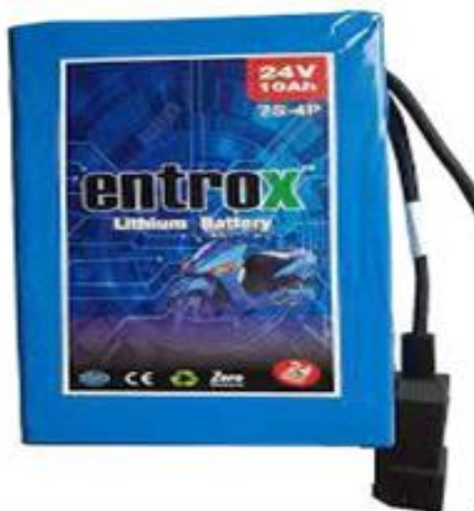
Figure 2: Lithium-ion battery (25.9 10ah)