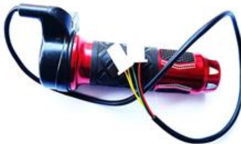
Figure 5: Motor speed controller

It will control the speed of the cycle it was connected to the controller then the controller will pass according to the speed. The throttle twist controller is the only one that controls the velocity of the electric bike. The throttle controller looks much like the partner accelerator throughout a bike that controls the go with the drift of the fuel line to the IC Engine. Here the motor pace is managed through the motor controller in correspondence with the enter from the throttle twist. The throttle twist grip has three wires that square measure connected to the motor controller. The motor controller used in the experiment is shown in Figure 5