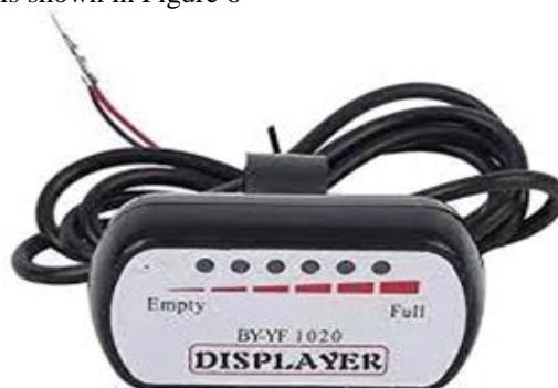
Figure 6: Charge indicator

It will show how much charge remained in the battery according to that we can charge the battery and manage the distance. The charge indicator used in the experiment is shown in Figure 6