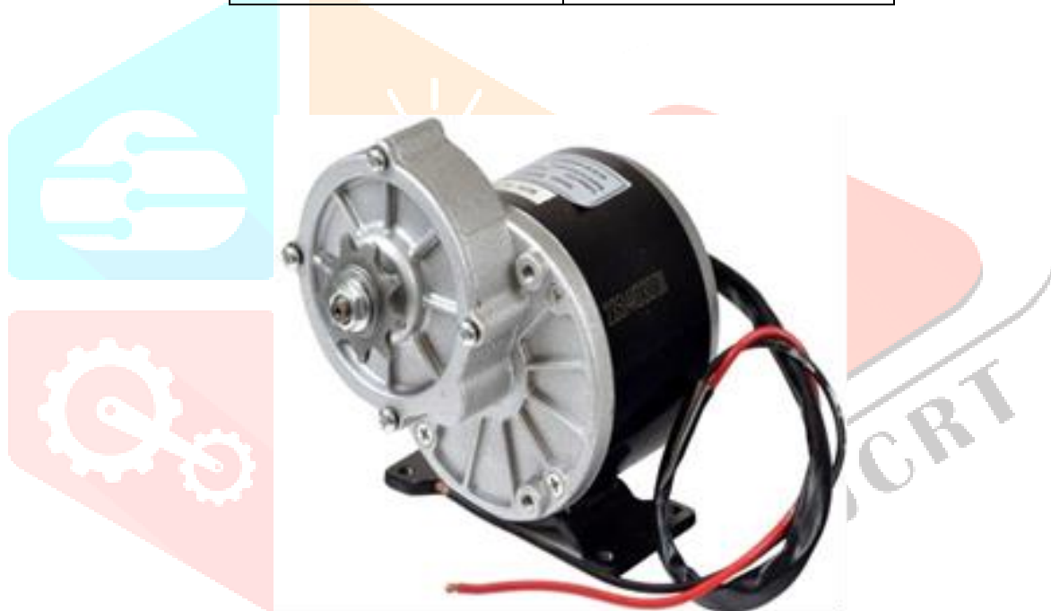
Figure1: BLDC motor (24v 350w) gear DC Motor 324RPM