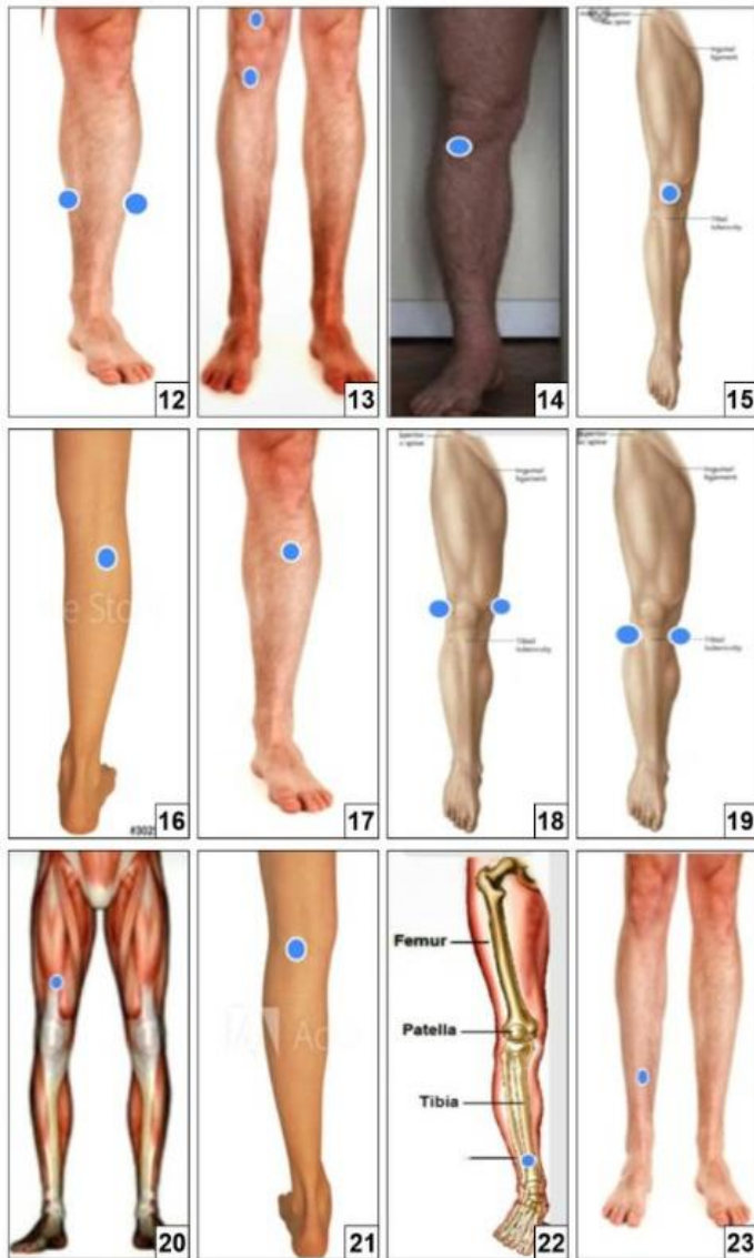
12.Theetha Varmam 16.Kantha Varmam 20.Aani Varmam 13.Mootu Varmam 17.Mudavu Varmam 21. Muzham kaal Varmam 14.Noythalai Varmam 18. Pakka Varmam 22. Konasanni Varmam 15.Sirattai Varmam 19. Asaivuthirikanmu Varmam 23.Komberikalam