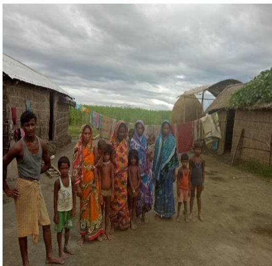
IMAGE 4.1 Women and Children in the Char of Goroimari Block