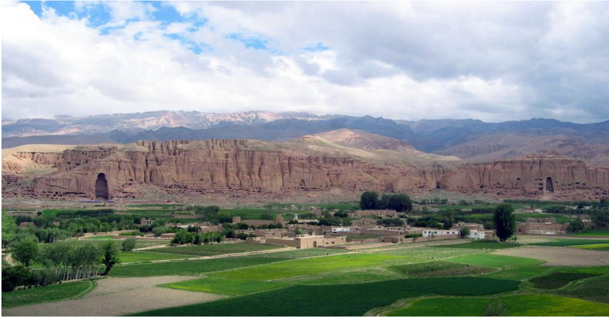
Landscape and Archaeological Remains of the Bamiyan Valley