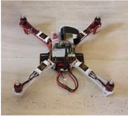
Fig 3 :Output of Drone