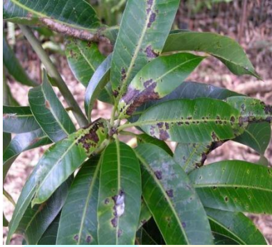
Figure:Mango plant image captured