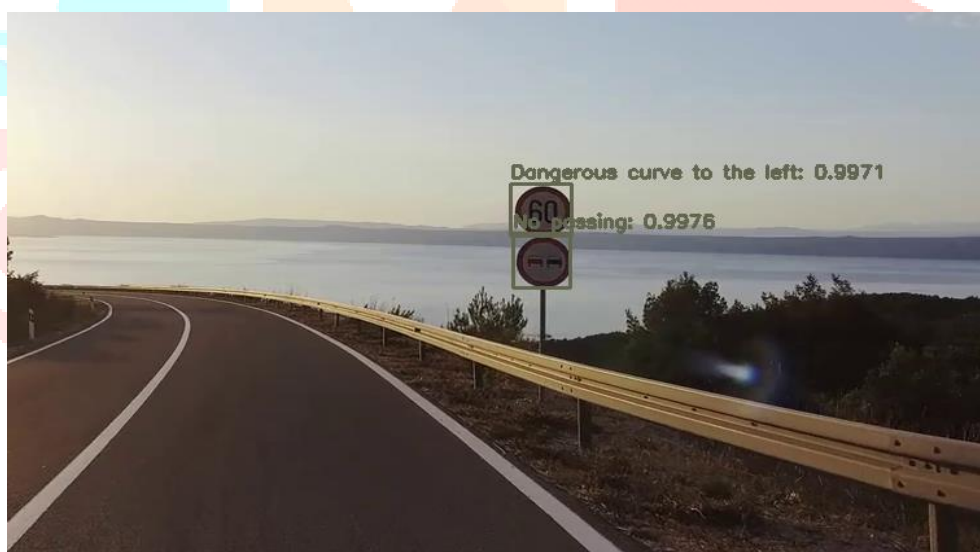
Fig 5.2 Detecting dangerous curve and speed limit