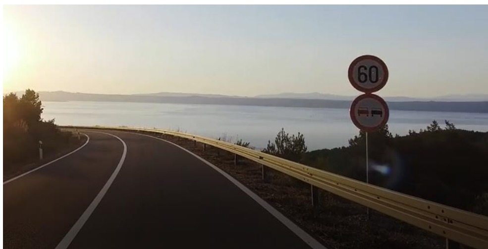
Fig 5.1 Given video frame

Below show the output of our application.