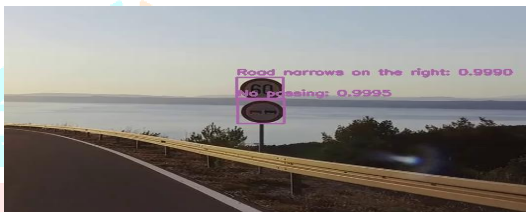
Fig 5.4 Showing narrows on right side and no passing

The above figures shows the input and output of our application. In fig 5.1 is the given inputted video. Here the video is divided as frame for processing. In Fig 5.1 detection of dangerous curve and speed limit has taken place. While in Fig 5.3 the speed limit and also detect the no passing board is done in there. Fig 5.4 detect there is narrows on right side of the road. By detecting all of these traffic sign and curve an voice alert is produced to the driver. The curve is using house line transform method, that is by the detecting the direction of the lines of road.