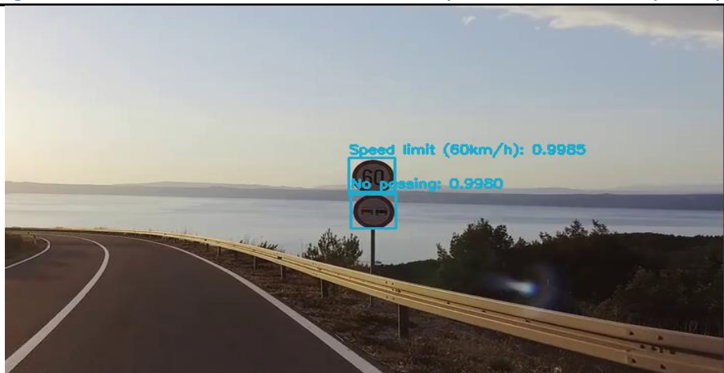
Fig 5.3 Detect the speed limit and no passing board