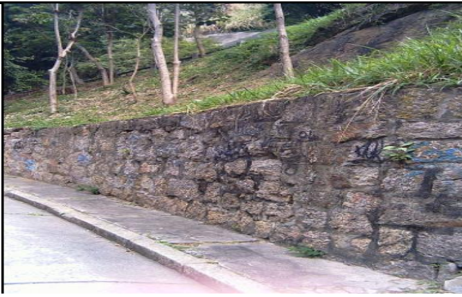
Fig:1 RETAINING WALL

2.2. GEOTEXTILES :- Geotextiles are those fabrics used in geotechnical operations, similar as road and road dikes, earth dikes, and littoral protection structures, designed to perform one or further introductory functions similar as filtration, drainage, separation of soil layers, underpinning, or stabilisation. Thus, nearly every geotextile operation is multi-functional.