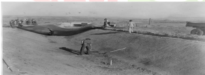
Fig:3 Canal Lining

2.3. CANAL LINING :- Canal lining is the process of reducing seepage loss of irrigation water by adding an impermeable subbase to the edges of the fosse. Seepage can affect in losses of 30 to 50 percent of irrigation water from conduits, so adding lining can make irrigation systems more effective.