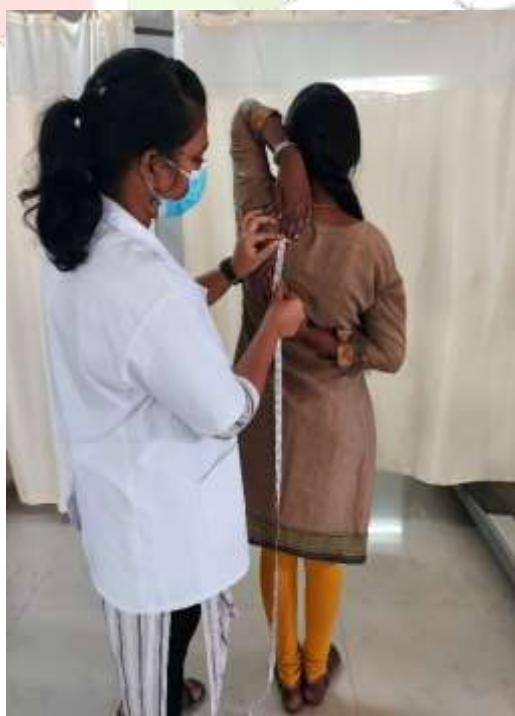
Figure 2(b) : Shows measurement of pectoral muscle tightness using inch tape in Back scratch test.