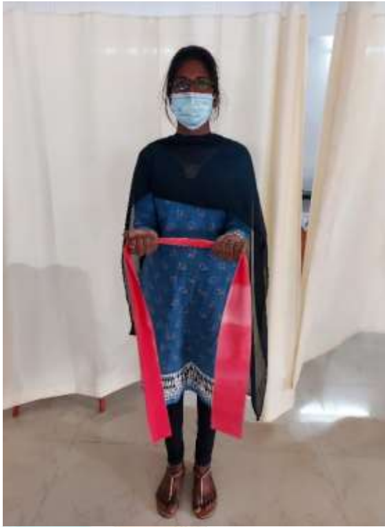
Figure 1(a) : Shows theraband holding position for Scapular retractor strengthening exercise.