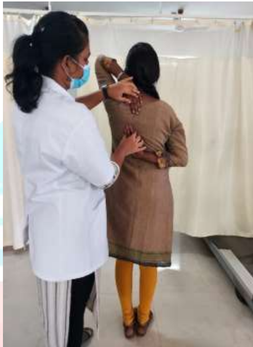
Figure 2(a) : Shows positioning for Back scratch test