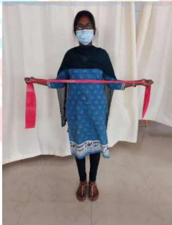
Figure 1(b) : Shows Scapular retractor strengthening exercise using Theraband