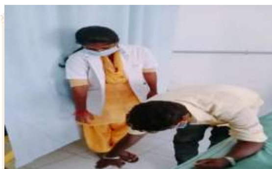
Figure 3: Therapeutic exercise (codman's exercise)