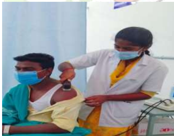
Figure 1: Ultrasound therapy