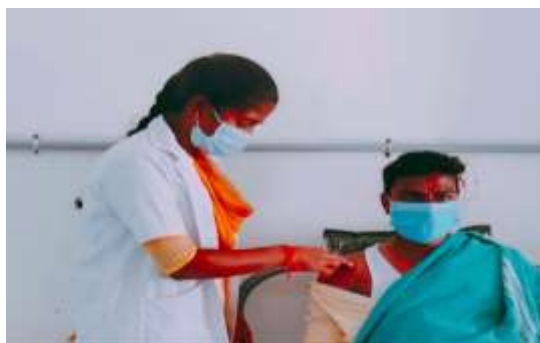
Figure 2: Deep friction massage

GROUP B: ultrasound therapy combined with deep friction massage and therapeutic exercise (Codman's exercise)