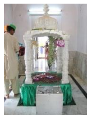
Fig.2.Mazar of Baba Nanak and Mari of Guru Nanak in Kartarpur Sahib

been an important requirement while erecting a Sikh Gurdwara even today, not far from the main darbar hall. 12 Situated 80 kms from Sialkot, a centre of Islamic studies and about 35 kms from Batala, an important