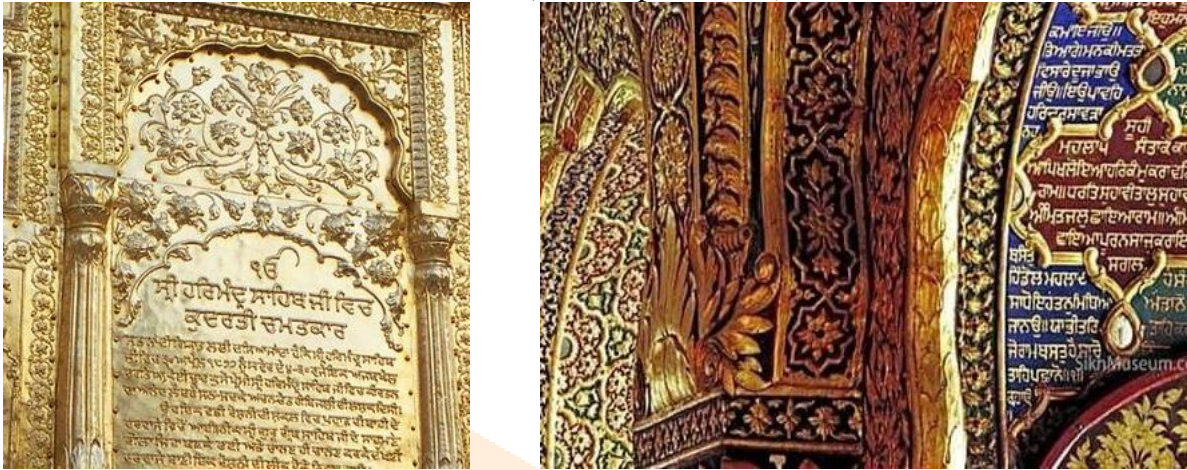
Fig 3.4. Inside Golden Temple, Indo- Islamic Orientation: Gold plated Art work

was able to complete the construction of the sacred tank in AD1589 .Hazrat Mian Mir,a Muslim saint laid the foundation stone of the Harimandir ,at the invitation of the guru.The Guru started compiling the bani of his predecessor ,adding his own and as well as compositions of the other regional Bhaktas.The work of compilation was completed in 1601 ,and the Granth( Scripture )was installed there in 1604..The Granth Sahib rested at a seat under the canopy, whereas the Guru and the Sikhs slept on the ground.”After its installation, Guru Arjun directed that during day time the Adi Granth should remain in the Harimandir Sahib and at night, after the sohila was read, it should be taken to the room he had built for himself in Guru ke Mahal. The Granth Sahib was placed on the appointed seat and the Guru slept on the ground by its side. 20 For two hundred years,Sikhs refers to it as Harimandir Sahib ( the temple of God) or Darbar Sahib. 21