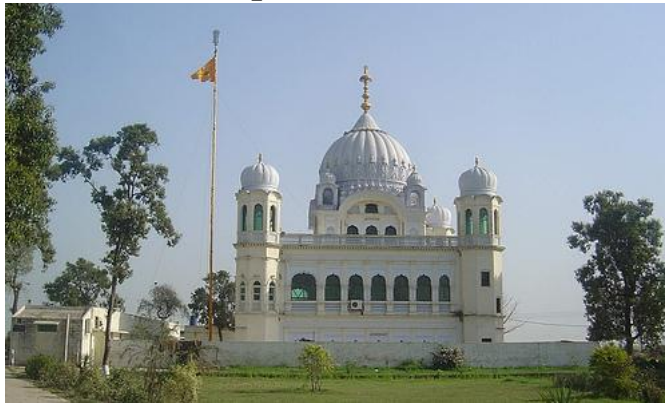
Fig.1.Gurdwara Sri Kartarpur Sahib, Pakistan