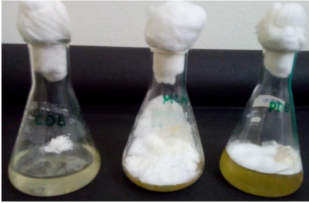
Basidiocarp formation of pleurotus species in darkness using different media (Figure-1)