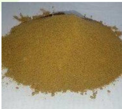
Morinda Citrifolia Extract