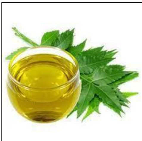
Fig. 1.1 Neem

Neem has been shown to have significant effects on both gram-positive and gram-negative bacteria and other bacteria that cause a wide array of human and animal diseases including E.coli , streptococcus.