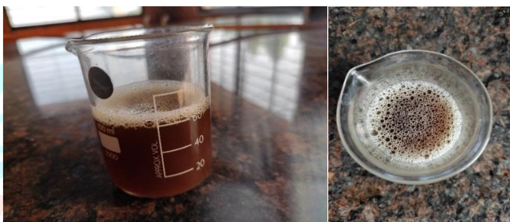
Fig. 4.1 Formulated herbal of Mouthwash