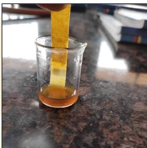
Fig. 4.2 Measuring of pH value

Here I used pH paper for measuring pH value. In 5ml of mouthwash a pH paper dipped into it. It showed a color which detected the pH range between 6-7 by comparing it with standard pH color range. Thus, pH value found is between 6-7.