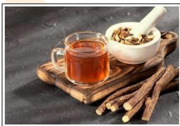
Fig. 1.5 Liquorice

Use of Liquorice, it is a natural sweetening agent as well as flavouring additive.