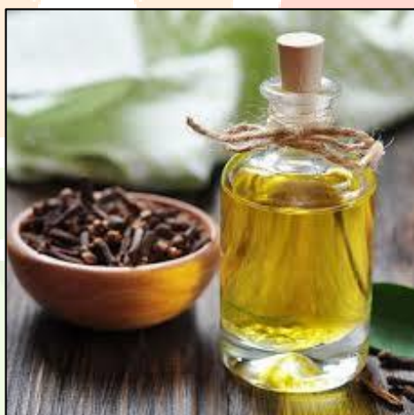
Fig. 1.3 Clove

Clove is dental analgesic also it fights bad breath, effective at fighting cavities, stimulate circulation.