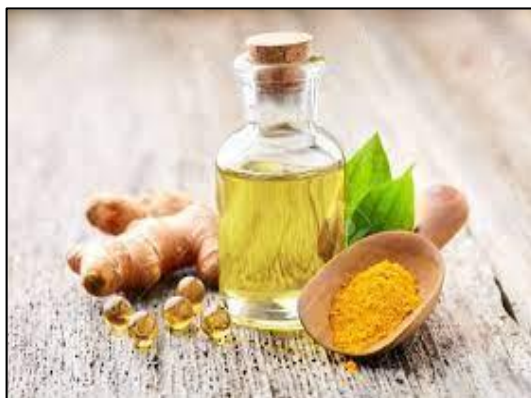
Fig. 1.2 Turmeric

It is anti-microbial and acts as bacteriostatic and bactericidal. Turmeric causes reduction in ulceration, burning sensation, reduce inflammation and also used as coloring agent.