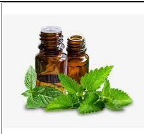
Fig. 1.4 Peppermint