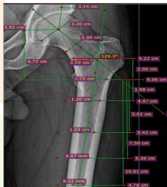
Fig.2: Measured value of anatomical parameter on femur

C Vertical offset (VO): The vertical distance between the center of the femoral head and the middle of lesser trochanter level