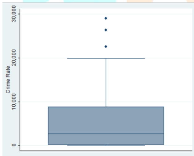
Figure 2: Box Plot