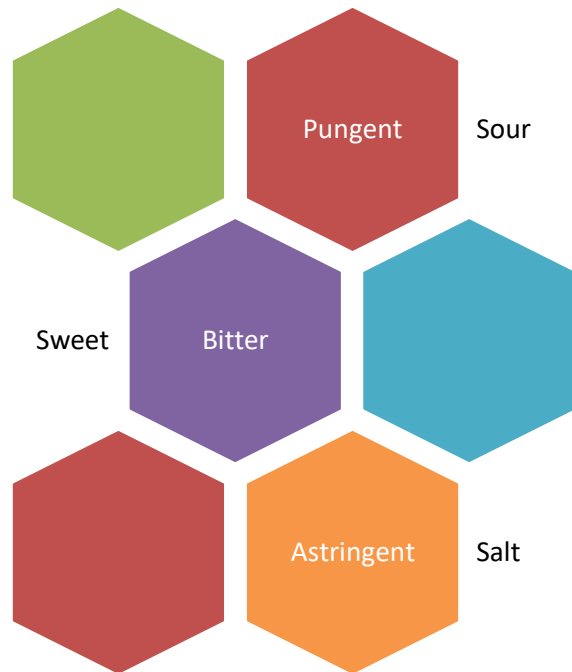
According to Ayurveda Six Rasas of the Diet

A good combination of these ensures the health of the digestive system and ensures that fewer toxins are absorbed into our body.