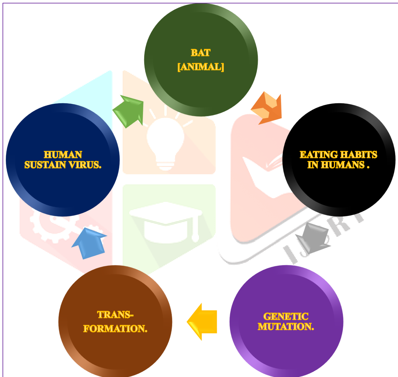
Fig. no.1. Mode of transmission.

Covid-19 is an infection that occurs due to the novel coronavirus which belongs to the Coronaviridae family.