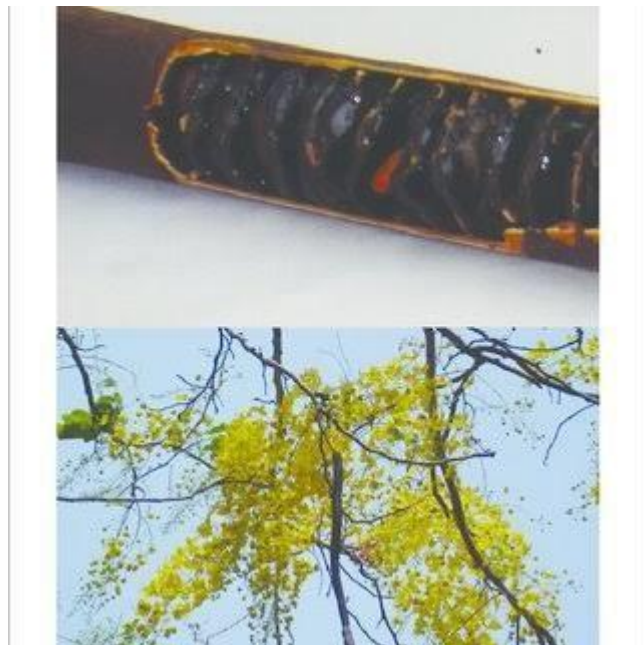
Fig 1:-Fruits of Cassia Fistula