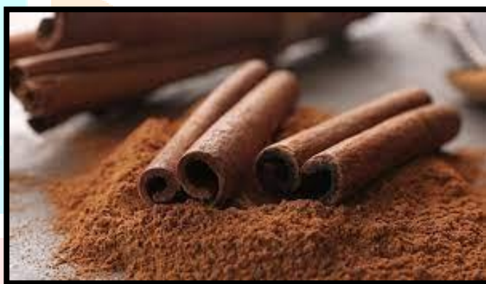
Fig no.1 Cinnamon