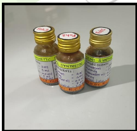
Fig.3: Prepared formulations