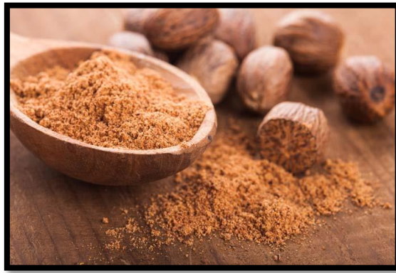
Fig no.2 Nutmeg