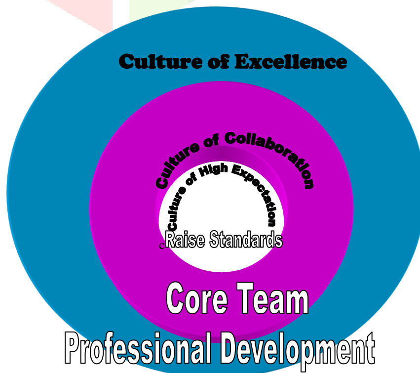
Figure 13. Proposed Action Plan to execute the Paradigm Shift in Mathematics Education