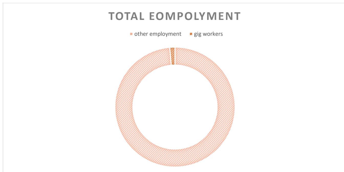
Fig 1. UK estimate of gig workers.

Information from Labour Force Survey, Jan-March 2022