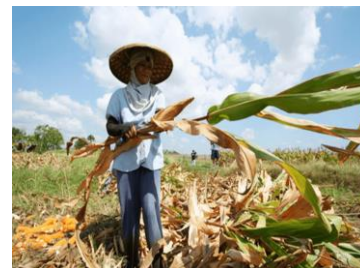
Figure 1. Corn Crop

Corn husk is a component that shields and guards the corn, and it is considered as the main part of the plant as its nature is to support and protect the corn. It is known and discovered that the fiber of corn husk has a unique characteristic, some of it are, its softness, durability, long life, and high moisture preservation. It is usually discarded after it has been peeled from the corn. It is considered to be a waste when the essential part of the corn is taken and completely thrown away after the harvest. Farmers burn it or simply ignore it until it rots and brings about bad environmental impact. Corn or Maize is the most widely distributed crop in the world. In recent years, there has been an increasing search for production of industrial raw materials from agricultural wastes in the hope of securing healthy environment. Today, "eco-friendly" has become one of the priorities of the world in global scenario and eco-friendly materials have been given importance so that even the agricultural wastes that are recyclable can be used toward this end (Jyothi, 2010).