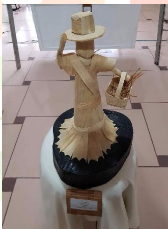
“VENDOR” Corn Husk Doll Sculpture