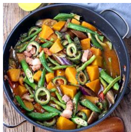
Figure 23. Pinakbet

Pinakbet is a popular food stew with a variety of vegetables that are typically selected from the vegetable garden or marketplace. It is known among Ilocanos, Tarlqueños, and Pampangueños as a famous and delicious dish. Nearby towns of Tarlac and Pampanga are known as the culinary capitals of the Philippines.