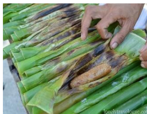
Figure 24. Tupig