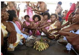
Figure 9. Aeta Food Forest Festival

The Aeta Forest Food Festival is held at Capas Tarlac near Mt. Pinatubo. The Aeta show how to hunt snakes, wild boar and, bayawak . In the festival the Aeta cook delicious food using traditional forest methods. They also showcase their dances, customs and ritual practices, in the festival.