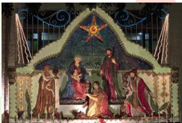
Figure 8. Belenismo Festival

The Belenismo Festival originally came from Tarlac Province. The word "Belen" is the place where Jesus was born and laid on a manger with Mary and Joseph standing by Him. Included in the depiction of the Belen are the Three Kings shown with their gifts, and along with them are the shepherds and their herd with a bright star shining above complete the scene. This is the most important Christmas string-happening and memorabilia. So that the Belenismo Festival reminds all Tarlaqueños and motorists and passersby what a most important and happiest occasions: The birth of Jesus.