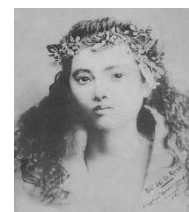
Figure 21. Leonor Rivera-Kipping (Maria Clara)

Leonor Rivera is the woman who was a significant part of the life of Jose Rizal. She was born on April 11, 1867 in Camiling , Tarlac. Rivera's romantic relationship with Jose Rizal lasted for eight years. Rivera was immortalized by Rizal in his novel Noli Me Tangere, featuring her as the character Maria Clara.