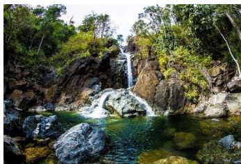
Figure 15. Timangguyob Falls

“ Timangguyob ” is a local term for a carabao blow-horn. The water that descends from the falls is in the pattern of a carabao horn. Local Aeta residents first discovered this beautiful place and breathtaking view. The falls is located in one of the barrio of Barangay San Clemente which is in Sito Dueg, Maasin.