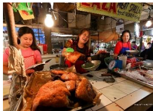
Fig. 25 Chicharon Camiling (Bagnet)

Chicharon Camiling is known as a special delicacy in Camiling, Tarlac. These are usually thick slices of pork belly and cooked deep fried. It is cooked brown and crispy to perfection so that it becomes crunchy and delicious at every bite. It has a bit juicy meaty texture taste so that it is crispy-delicious to the taste.