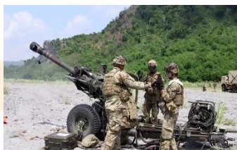
Figure 16. Air Base of Colonel Ernesto Rabina