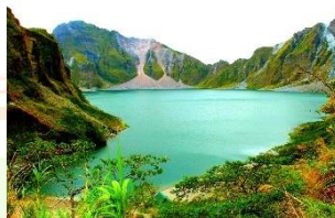
Figure 12. Mount Pinatubo

Mt. Pinatubo became a popular tourist destination after its eruption in 1991, the peaceful community of the people in one of the locals in the Province of Tarlac, named Sta. Juliana begins the adventure. Cruising walks demonstrate an opportunity occasion for everyone to feel and enjoy the viewpoint of lahar, along the river and a breathtaking view of the volcano crater.