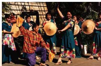
Figure 7. Pandango sa Sambillo

"Pandango sa Sambalilo" is a dance of love. The man makes the woman feel good about her dancing by getting her Sambalilo hat on the floor with his head and without the use his hands. It originated in Camiling, Tarlac. The "Sambalilo" refers to a small hat. The word comes from the Spanish word "sombbrero" for a hat.