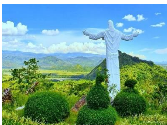
Figure 14. Monasterio de Tarlac

This beautiful nature and church are located above a mountain in San José, Tarlac. The Statue of the Risen Christ was built under the sponsorship of the late governor of Tarlac José "Aping" Yap. A similar statue of the risen Jesus Christ can be found in Rio de Janeiro. The one in Tarlac is with a Monasterio guarded by the Servants of the Risen Christ. From the Monasterio, the the "arqueta" can be seen. It is constructed as one essential part of the cross on which Our Lord Jesus died to save all of humanity.