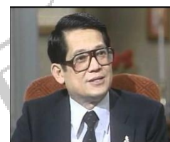
Figure 22. Benigno Aquino Jr.

Benigno Aquino Jr. was born on November 27, 1932. Ninoy was only 17 years old famous for being a Korean war correspondent. Became the youngest elected town Mayor in Concepcion, Tarlac. During the reign of Diosdado Macapagal, Ninoy joined the Liberal Party. He became the party's general secretary that paved the way for him to be elected youngest senator in 1967.