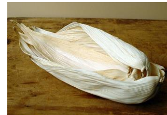
Figure 2. Corn Husk

In the study conducted by Mejia (2015), it is determined that corn husk is useful when producing fiber paper. It also determined the effectiveness of corn husks to reduce the need to cut down trees in which it is the source of paper production. With this, fiber paper has been produced that can be an environmentally friendly product. Due to the risk of and adverse effect on forest woods and environmental sustainability, studies have been directed towards aggressive research into the suitability of several agricultural waste substances from pulp for paper production. Growing worries on wood consumption and raw-material accessibility for the paper enterprise have resulted in a changed interest on the advantages inherent in numerous non-wood fibre plants, with every year harvest. (Jorge Gominho et al. 2001).