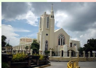
Figure 17. San Sebastian Cathedral

The Post-war neo-Gothic church exhibits a very elegant front with the figure of the patron saint in the middle corner of the entrance door. It is located in Brgy. Mabini, Tarlac City, Philippines. The cathedral was built and devoted to Saint Sebastian in 1686. It was completed in post-1945, or after World War II.