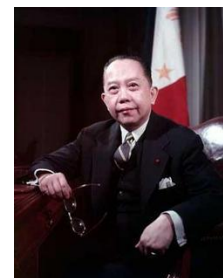
Figure 18. General Carlos Pena Romulo

Carlos Peña Romulo was born on January 14, 1899, in Camiling, Tarlac. He is a Filipino diplomat, politician, soldier, journalist, and writer. At the age of sixteen, he became a spokesman and then an editor of a newspaper at the age of twenty. He had a printing press at the age of two. He is the founder of the Boy Scouts of the Philippines. Romulo served nine Presidents of the Philippines from President Manuel Quezon to President Ferdinand Marcos either as a member of the cabinet or as the official representative of the Philippines in the United States and the United Nations.