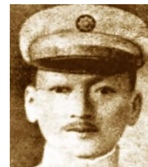
Figure 20. General Francisco Macabulos