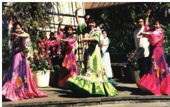
Figure 6. La jota Moncadeña

It is named after its origin, Moncada in Tarlac. This dance is highlighted by the musical rhythm of bamboo-made castanets and features a collection of Spanish-influenced dances. In the Philippines, there are many types of Jota dances. The names and varieties are developed from their region of origins where they are all valued. La Jota Moncadeña is an essential sequence of dance steps and music with Ilocano and Spanish characteristics.