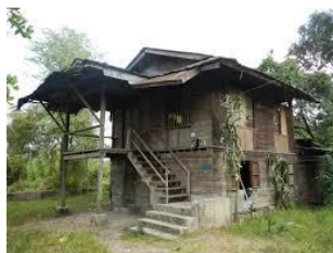
Figure 10. Francisco Macabulos Anscstral House