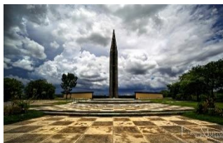
Figure 11. Capas Memorial Shrine

The Capas Memorial Shrine was founded on December 7, 1991. And it was built for valiant soldiers who suffered in what is historically known as the "Death March". Hundreds of soldiers suffered and died in the Death March. It was an event that highlighted the brutality of the Japanese Imperial Forces in the Philippines during the World War II. The Death March Monument depicts the patience and heroism of brave and loyal soldiers, freedom-defenders and the brotherhood of Filipinos and American soldiers alike.