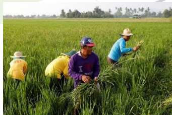
Figure 13. Hacienda Luisita Tarlac

Hacienda Luisita Tarlac is has a sugar plantation for about 1,135 hectare of sugar that owned by the family of Cojuangco, which includes former President Corazon Aquino and his son Noynoy Aquino. It is said to be the same size as the city of Makati and Pasig. During the American Period (1898-1946), Hacienda Luisita provided almost 20% of all sugar in the United States mainly due to the lack of supplies in from Cuba.