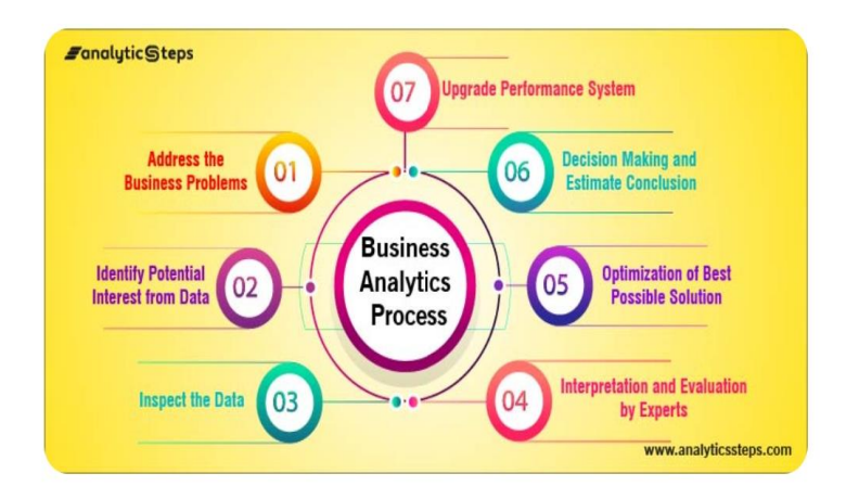
Step 1: Address the Business Problems

Initially, business problems need to be addressed, the purpose of applying analytics is sometimes designated categorically or broken into parts. So, relevant data is selected to address these business problems by business users or business analysts equipped with domain knowledge.