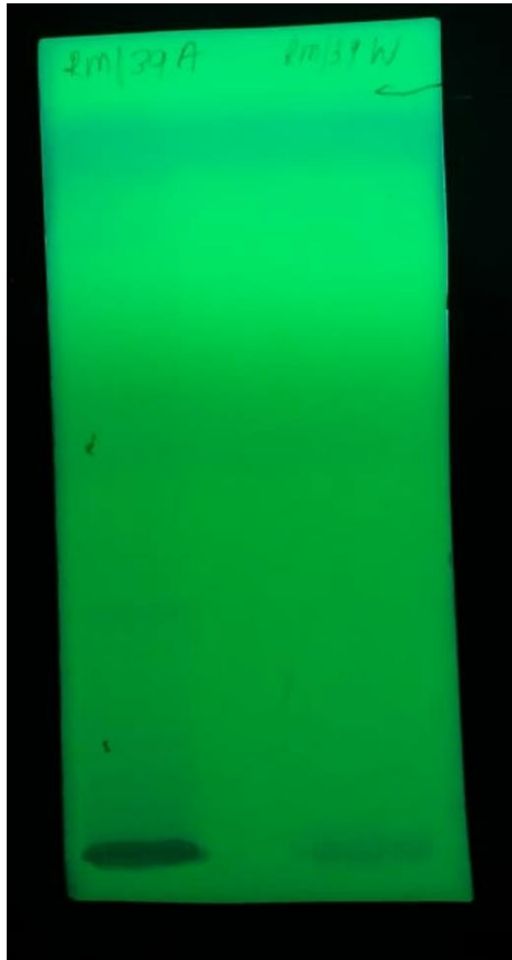
Table no 10. Antioxidant study report