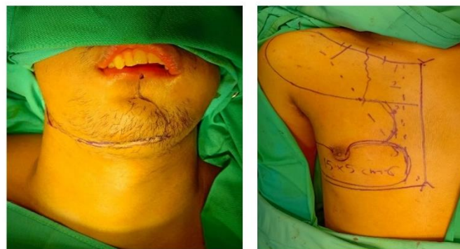
Figure 6. Incision in pectoralis major osteomyocutaneous flap reconstruction An incision according to the design of the pectoralis major osteomyocutaneous flap was done, harvesting of pectoralis major osteomyocutaneous flap accompanied by removal of the 6 th rib with preservation of the right thoracoacromial and periosteal veins (Figure 7)

The patient underwent reconstruction surgery in August 2019. The reconstruction carried out by closing the defect using a pectoralis major osteomyocutaneous flap. The resected mandibular bone structure was replaced with patient's 6 th rib and the soft tissue structure was reconstructed using a pectoralis major myocutaneous flap. The incision design is depicted in Figure 6.