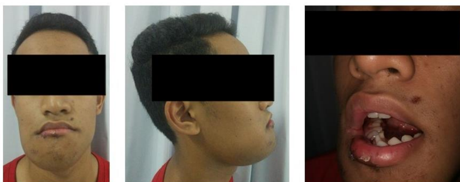
Figure 1. Clinical condition of the patient

18 years old male patient complained of a lump in his right lower jaw since approximately 5 years ago (Figure 1). The lump was getting bigger slowly. The patient did not complain of pain at the location of the lump. The patient complains of difficulty opening the mouth and chewing. The patient also felt uncomfortable cosmetically. The patient did not experience weight loss. From physical examination, the mass was located on the right mandible. The mass was fragile and there was no pain in the mass. The panoramic photo is shown in Figure 2. The panoramic radiograph showed an expansive lytic lesion that formed a soap bubble appearance in the right mandible from the angle to the left mandibular parasymphiseal. Radiologic examination showed typical features of ameloblastoma.