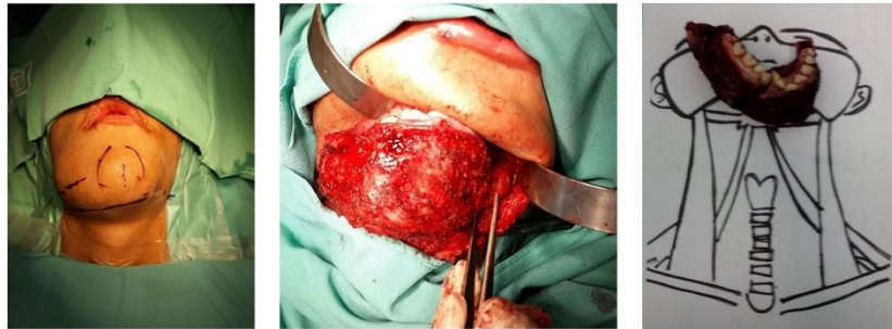
Figure 3. Specimen and finding during the first surgery

The patient underwent the first surgery in October 2018. In this operation, a mass of the mandible was resected from the right angle of the mandible to part of the left mandibular parasymphiseal (Figure 3). On histopathological examination, it was concluded that it was an ameloblastoma, plexiform type. This procedure left a LC-type defect on the mandible. Therefore, mandible reconstruction using plates was performed.