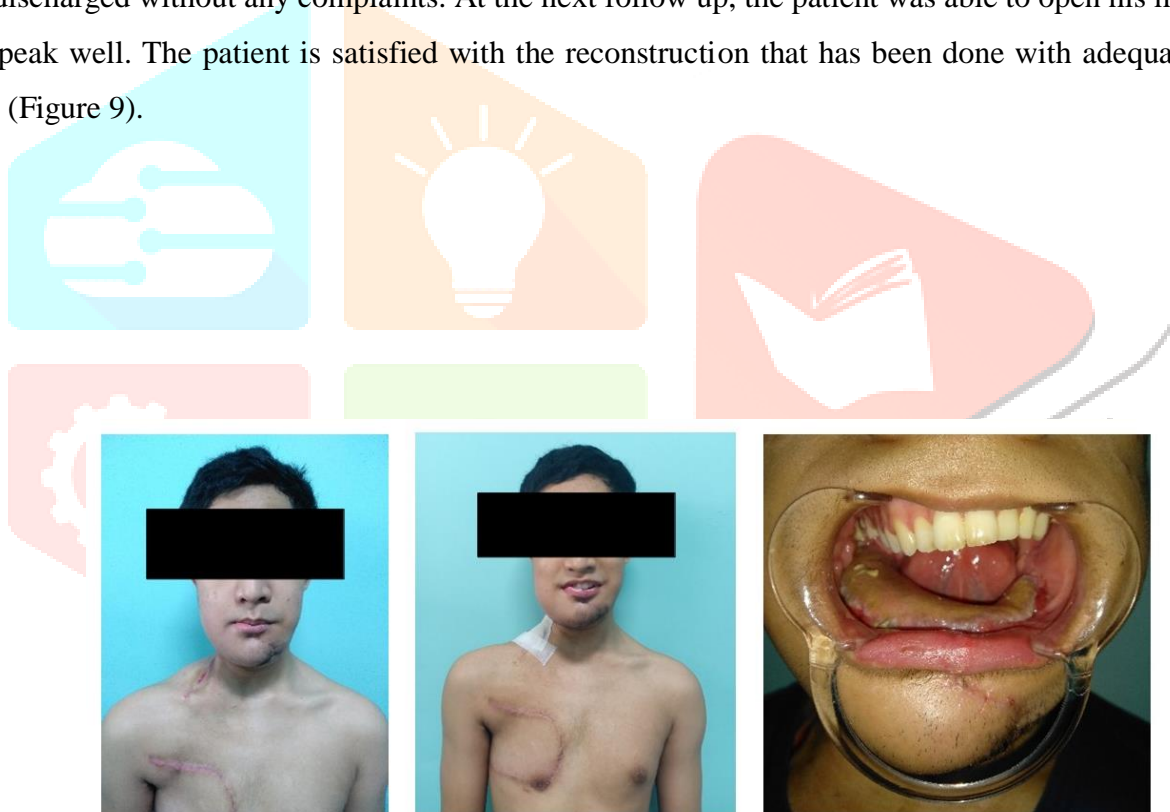
Figure 9. Clinical condition at first follow-up after reconstruction with plate and pectoralis major osteomyocutaneous flap

After undergoing the second reconstructive surgery procedure, the patient was evaluated clinically and then discharged without any complaints. At the next follow up, the patient was able to open his mouth, chew and speak well. The patient is satisfied with the reconstruction that has been done with adequate cosmetic result (Figure 9).