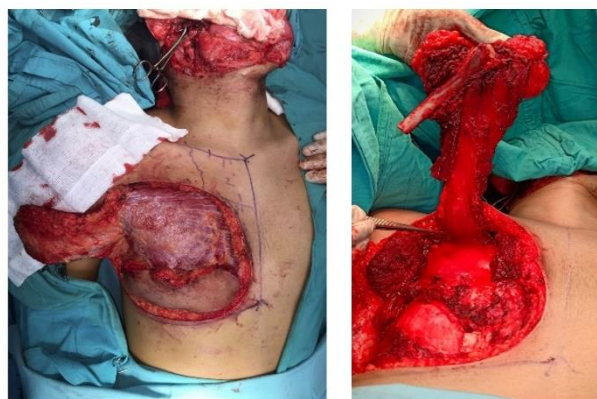
Figure 7. Harvesting pectoralis major osteomyocutaneous flap

Figure 6. Incision in pectoralis major osteomyocutaneous flap reconstruction An incision according to the design of the pectoralis major osteomyocutaneous flap was done, harvesting of pectoralis major osteomyocutaneous flap accompanied by removal of the 6 th rib with preservation of the right thoracoacromial and periosteal veins (Figure 7)