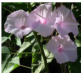
Figure 1 Ipomoea carnea Plant

Domain: Eukaryota Kingdom: Plantae Phylum: Spermatophyta Subphylum: Angiospermae Class: Dicotyledonae Order: Solanales Family: Convolvulaceae Genus: Ipomoea Species: Ipomoea carnea