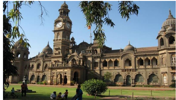
Fig 4: Mumbai university

of the structure, there will seating arrangements available outside the structure to give an “open space literacy terrain” to scholars. The resource center’s Collection is concentrated on the Digital images and Publish Resource (National and International Journals, eBooks) and produce the literacy terrain in an open space handed with Wi-Fi and special kind of conference installations and also connected to other libraries (16).