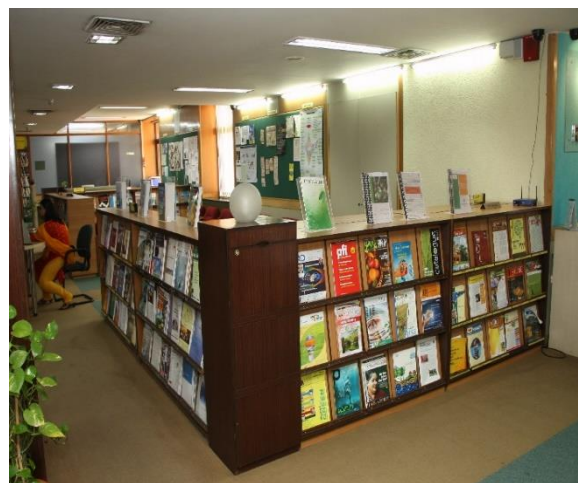
Fig 8: TERI-Library

The Library and Information Centre of TERI serves primarily to meet all information requirements of in-house experimenters; the Centre also serves energy and terrain professionals worldwide by furnishing value-added information services (20).