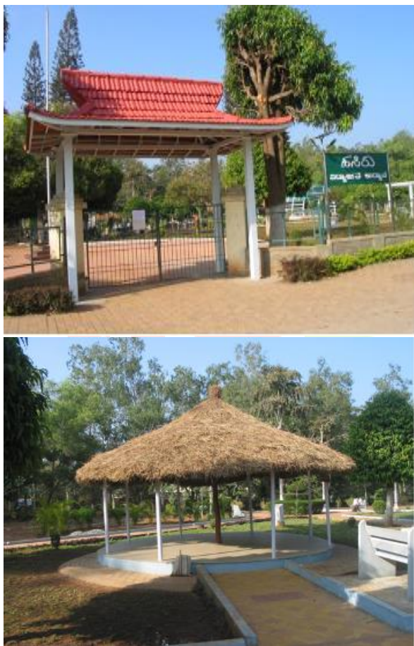
Fig 3: Karnataka university library

The main library allows scholars to pierce books but they cannot go for group or combined studies and bandy the subject matter inside the library. This is coming in the way of understanding the subjects completely for the scholars. Realizing this chain in literacy, the varsity decided to set up the eco-library. Scholars who have time to spare before their coming class and who wish to go through handbooks or have a discussion can drop into the eco-library. Also, those preparing for examinations can use it and need not go to the main library which is a little down from the main structures. Nearly all postgraduate departments of the university are located in the surroundings of the eco-library (15).