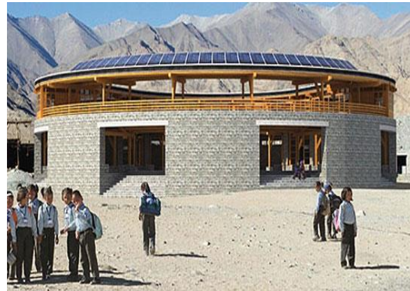
Fig 6: The Perma Karpo Library

5.5 Indian Institute Technology (IIT) Library, Roorkee-Mahatma Gandhi Central Library of the Institute: finds a unique place in the academic library script in this part of the world. It's an admixture of the classic and the ultramodern. While it's one of the oldest academic libraries in the country, it's housed in an sq. ft. state-of-the-art ultra-modern centrally broiled structure equipped with all the rearmost ICT installations spread over four bottoms.