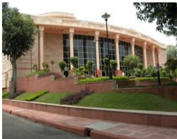
Fig 7: Green campus of IIT-R

More Green Enterprise is being planned for wastewater treatment as well as recycling and rainwater harvesting in a decentralized manner. Out of the total solid waste generated in the lot separating organic and inorganic waste is being planned and reviewing the available technology that can co-generate biomass energy from our organic waste (19).