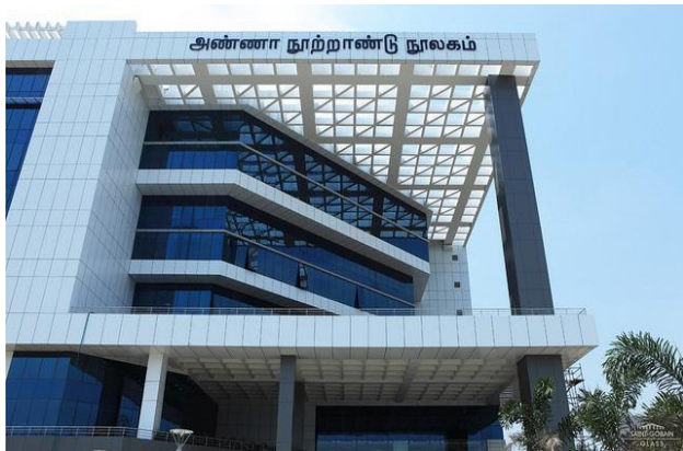
Fig 5: The Anna centenary library

unique achievement for the Tamil Nadu State Government and happens to be the first library structure in the Asian region to get this coveted standing (17).