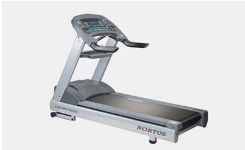
Fig 2 Treadmill