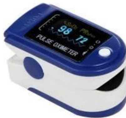
FIGURE 3 PULSE OXYMETER