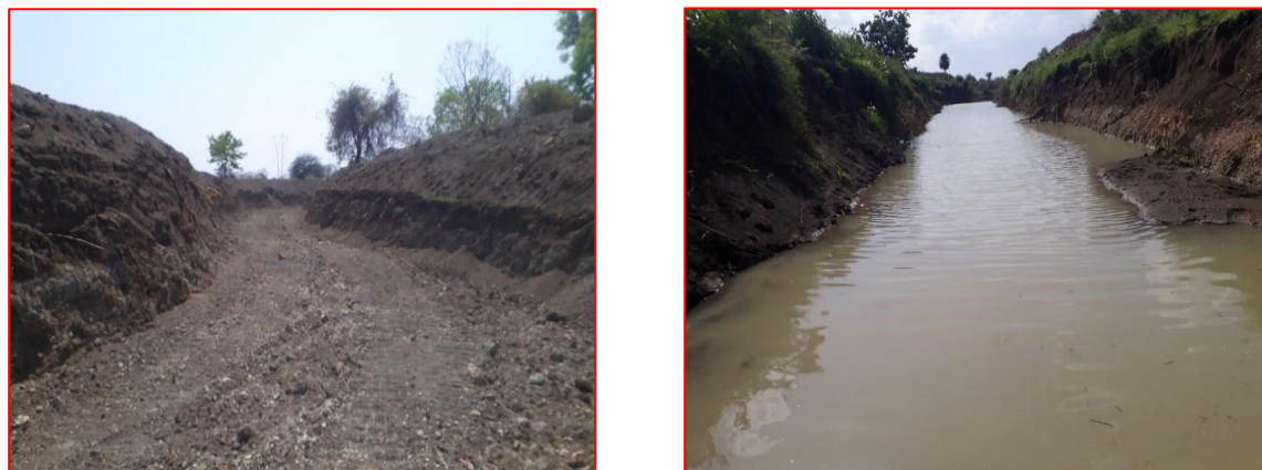
Fig 1 Nalla deepening in Ashta village before & after