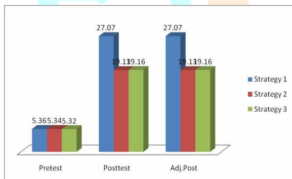
Figure 1. Comparative bar diagram of Adj. post test achievement scores of Visual students in Graphic Organizer, Self Questioning and Problem Solving.

The Adj. AM of post test scores of the G.O group is 27.07 with SE 0.49 and 95% confidence interval ranges from 26.09 TO 28.05. For the S.Q group Adj.AM of post test scores is 19.13 with SE 0.46 and 95% confidence interval ranges from 18.21 to 20.04. For the P.S group Adj.AM of post test scores is 19.16 with SE 0.52 and 95% confidence interval ranges from 18.12 to 20.19. This results indicates that the Adjusted AM of post test achievement scores of visual students who were exposed to the three experimental treatment showed differences in their academic achievement in Malayalam language which again implies that the three select classroom practices have varied impact on the visual students in language learning. The comparative bar diagram of Adj. post test achievement scores of Visual students who were exposed to the select three meta cognitive classroom practices namely, Graphic Organizer, Self Questioning and Problem Solving is shown in Figure 1.